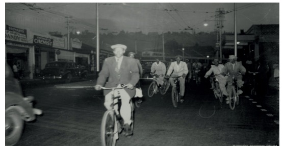
Workers cycling along Louis Botha.