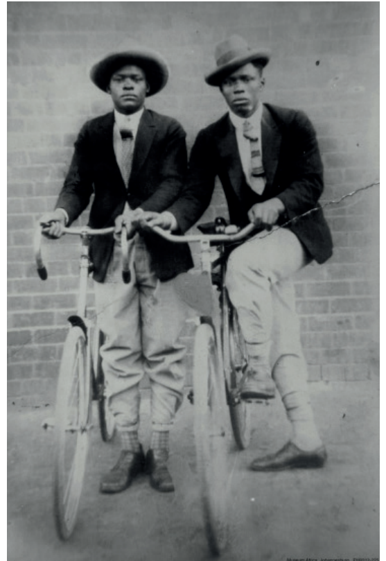
Two early cyclists on the Rand.