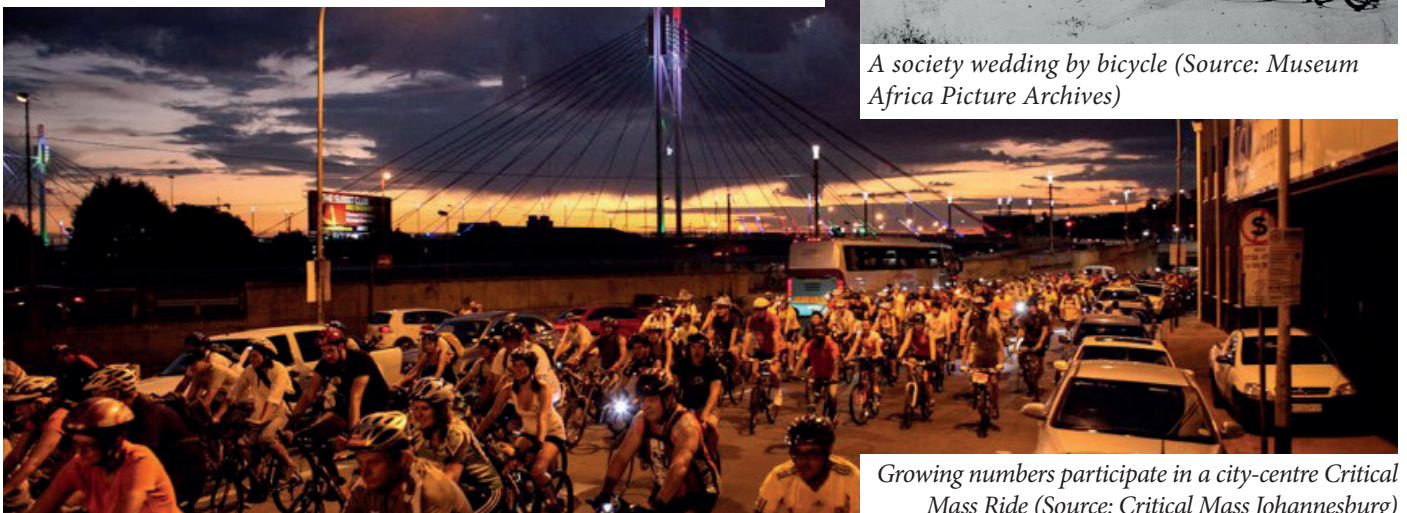
Growing numbers participate in a city-centre Critical Mass Ride