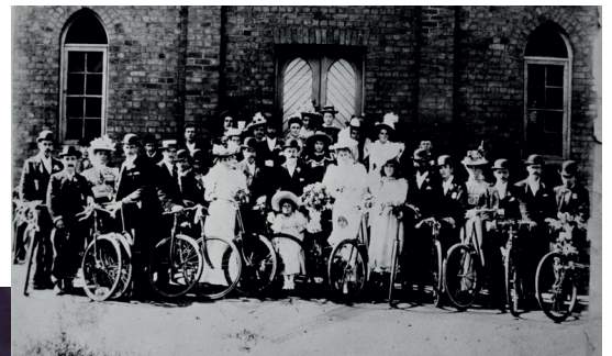
A society wedding by bicycle